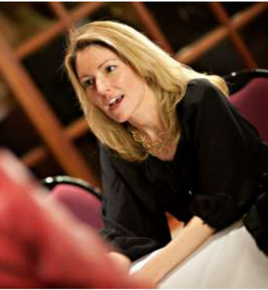
Kathryn Stockett signing her book, The Help, at the Tower.